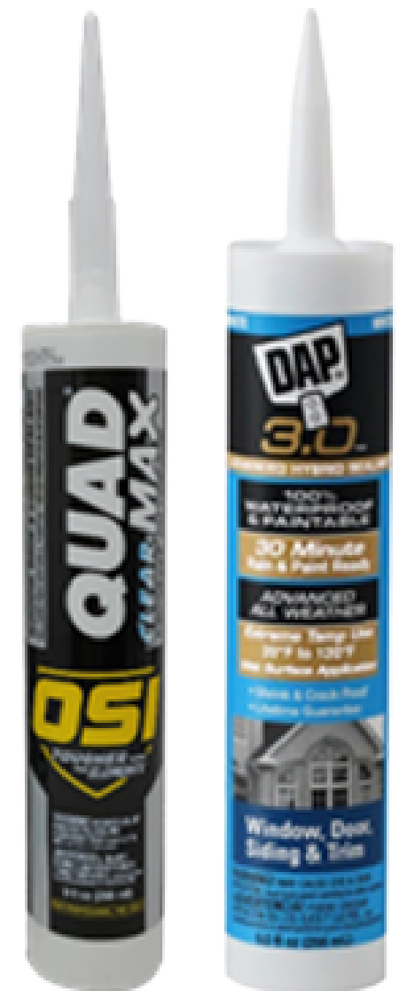
Examples of Hybrids

Like urethanes, they also run into some issues with damp surfaces. One of the more interesting things about this swap is that manufacturers often recommend that hybrids not be tooled, which can lead to application issues with beads that do not look great.