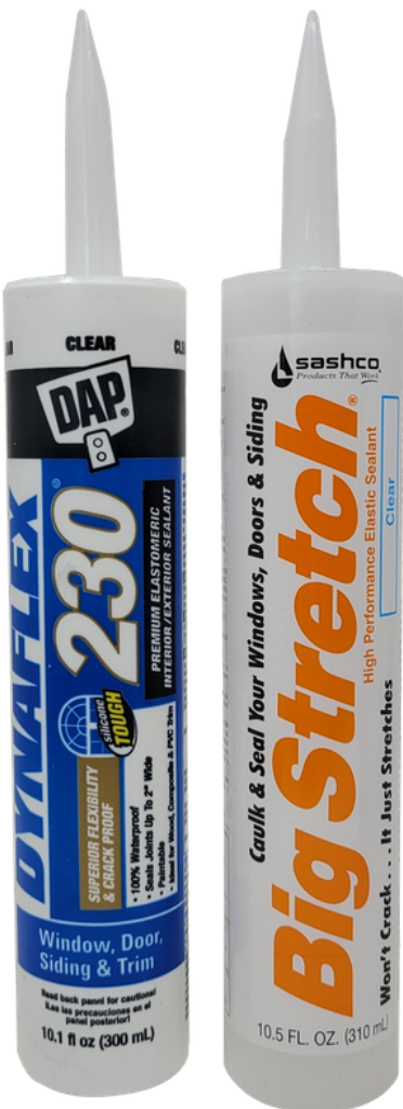
Examples of Acrylics