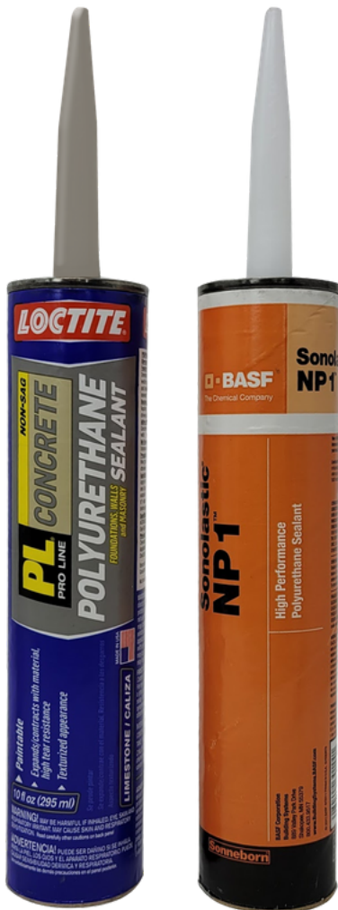
Examples of Urethanes

Acrylics can also be a bit less forgiving in cold temperatures. If you are able to get the urethane to dispense out of the gun, it will cure at that low temperature.