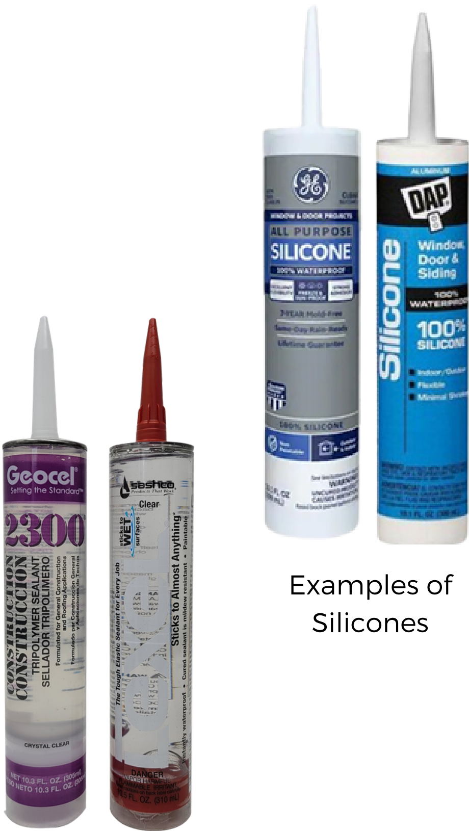
Examples of Silicones

Copolymers have a high degree of elasticity, meaning that they will be in a relaxed state rather than stressed