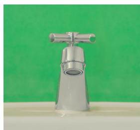
BATH & KITCHEN FIXTURES