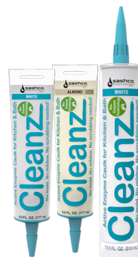
WHITE 10.5 OZ & 6 OZ ALMOND 6 OZ

Through our research we discovered the power enzymes can bring to caulking. The same enzymes that breakdown oils in your stomach, can now be used to fight mold in our living spaces. So, we went to work and out of that Cleanz® was born.